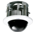
WV-QED100C-W Ceiling Mount Bracket