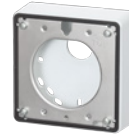
WV-QJB500-W Mount Bracket