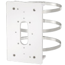
WV-QPL500-W Mount Bracket