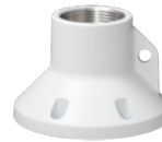
WV-QCL101-W Mount Bracket