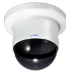
WV-QCD100G-W Dome Cover