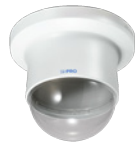
WV-QCD100C-W Dome Cover